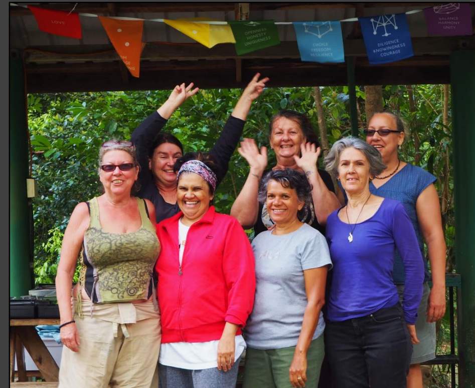
Cultural Retreat, Wallaby Creek, September 2020

Our souls do not speak human language; they communicate to us through symbols, metaphors, visions, poetry, deep feelings, and everyday magic.